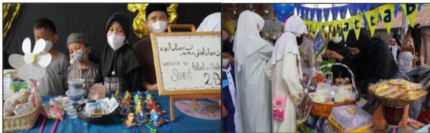
Figure 7. Entrepreneur Day

"The Entrepreneur Day program is one of the activities that aims to increase the entrepreneurial spirit, and cooperation between student participants, and as a place for students to apply their creativity as well. In addition, students are also trained in making selling plans. In this activity, each group will make a report to the teacher. This activity is in the form of learning to sell various student works, especially in terms of food and beverage creations. Students are given capital that can be used to procure tools and materials both for goods to be sold and for marketing. Then, each team is required to return the capital to the school after they finish their business. Student activities in the Entrepreneur Day program vary such as preparation, implementation, and reporting of the results, and will be included in the students' report for aspects of performance or psychomotor values." (Figure 7)