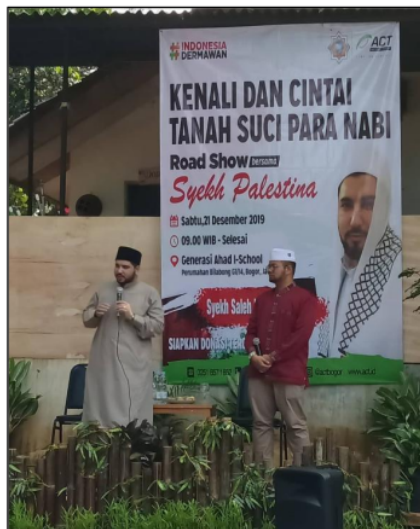
Figure 1. Students learn the culture of other countries (Arabic culture)