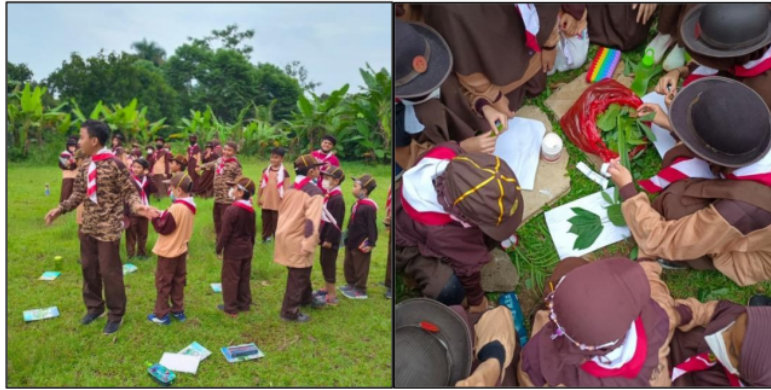
Figure 11. The students are doing an outdoor activity and camping at the same time

The last aspect is the spirit/connectional aspect which is shown by admiration for nature, expressions of praise, and a sense of comfort in nature. According to the facilitator, students often enthusiastically tell stories about their admiration for the natural environment created by Allah The Almighty. This is supported by the results of observations on camping activities. The students are very happy to be invited to have an adventure in nature. They are enthusiastic to sleep in nature. After camping, they could not stop recounting their experiences both orally and in writing. Students write down their amazement and admiration for the open nature. For example, during the lesson, when there was an insect theme, someone brought up material about spiders. The students were amazed when they saw the way the spiders beautifully make their nests. The pattern is neat and strong, too. Besides, the nests can function to trap their prey. They often observe, admire, and understand that Allah created these creatures with the ability to survive. Another example, is when climbing an ancient volcano, many children participated and they expressed their admiration when there were very large rocks or very large trees that they had never met at school.