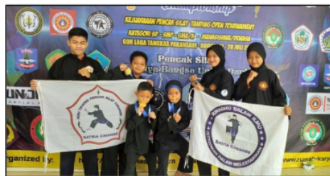
Figure 4. The extracurricular activity of Pencak Silat

The history of pencak silat initially developed from the ability of indigenous Indonesian tribes to hunt and fight using weapons of war such as machetes, shields, and spears. This discovery also corresponds to a weapon artifact from the Hindu-Buddhist era which is filled with sculptures and reliefs depicting horses, as the basic movements of pencak silat, which are also found in Borobudur Temple and Prambanan Temple (Hasibuan et al., 2022; Kuswanti et al., 2019; Siswantoyo & Kuswarsantyo, 2017). Pencak silat can provide the ability, skills, and stability to defend and defend oneself against a threat of danger, either within or coming from outside, and to ensure harmony with the natural surroundings (Hasibuan et al., 2022) (Figure 4).