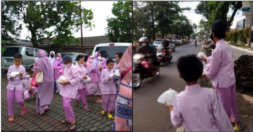
Figure 6. A social service activity

The most important spiritual load activity tested at the end of each semester is the Tahfidz Qur'an program. Tahfidz Qur'an means memorizing and can be interpreted as a process of repeating a lesson, either by reading or listening to study the Qur'an. The Tahfidz Qur'an program is carried out using the Kauny Quantum Memory method. The technique is implemented by optimizing the intelligence of the right brain to capture visualization of meaning, illustration of meaning, making up stories, and having hook words in pictures to make it easier for children to remember them. This method is introduced with illustrations of pictures and stories or movements that are unique and sometimes funny. The stories are designed for people to memorize verse by verse more easily and can provoke brain memory so that it will make memorization more memorable and build a love for the Al-Qur'an (Amin & Pratama, 2018; Baqi & Asterisk, 2022; Engkizar et al., 2022).