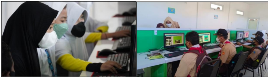
Figure 2. The students are studying the latest learning applications with computers

Furthermore, students are accustomed to using tablets and PCs (personal computers) in learning. The tablets and PCs used by the students are equipped with the latest learning applications. Based on observations, teachers even use books that are different from those used by other elementary schools. The teachers make an augmented reality book that is not only equipped with 3D forms of subject matter but also moving visuals and audio. So in every lesson, students have to use a tablet to scan the book. The PCs are also used as a medium for students' private study where they can store their files. Students must be familiar with all digital systems in an all-digital era so that the purpose of learning with tablets and PCs is to make them familiar with digital technology in the future (Omar et al., 2021; Reinsfield, 2018). The involvement of information technology in the field of education is important to support educational factors from upstream to downstream which consist of learning methods, learning media, human resource quality, and creating a supportive academic environment and atmosphere (Jariyansah & Rohmantor, 2018; Tafonao et al., 2020). Optimum and strategic utilization of IT is an important factor in increasing the quality of education in the digital and globalization era (Novianti & Maria, 2019; Omar et al., 2021; Reinsfield, 2018) (Figure 2).