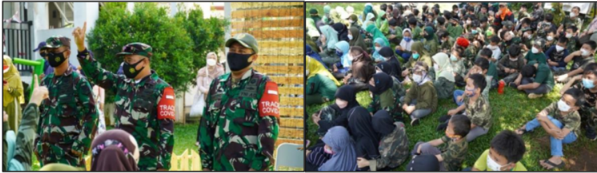
Figure 8. The activity of introducing professions to students

development of students; (2) to introduce how science is applied in the real world (3) application of material that has been learned in learning with practice in the field; and (4) provide students with an understanding of the world of work (Al-Atabi et al., 2013; Behrendt & Franklin, 2014; Markom et al., 2011; Students, 2021). ). Furthermore, students are also invited to get to know various professions such as the TNI (Indonesian Military Force), Firefighters, Youtubers, Photographers, Pilots, etc. The benefit of introducing the profession to students is that it can add students' insight. Students will become aware of the various types of professions, technical work, and their impact on society. Students can also develop good attitudes and behaviors in children such as being open-minded, confident, optimistic, and tough to reach their goals. In addition, children can appreciate every profession regardless of differences (Balyer & Özcan, 2014; Xing et al., 2019) (Figure 8).