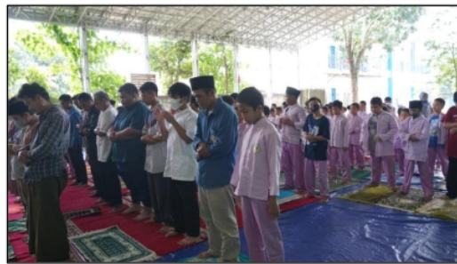
Figure 5. A congregational prayer activity

41 Based on the research data, it is known that spiritual habituation in schools includes activities that are carried out regularly or continuously which aim to adjust students to do good things. Habituation can be described as one of the educational methods needed to build good students' character. Good habits must be implemented in the closest environment such as the family, by parents to children without intervention. If such habituation is carried out continuously, it will certainly make good values embedded in children without being accompanied by a sense of compulsion. Such good habits will slowly crystallize and become ingrained in them so that they are reflected in their character and personality (Arti, 2018; hwan Shim, 2017; Rohana, 2019; Shim, 2017) (Figure 6).