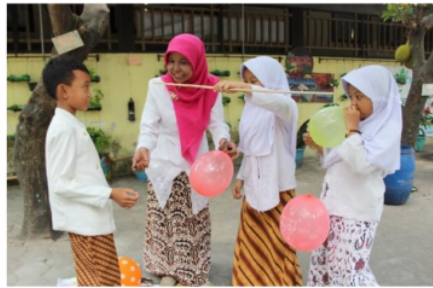
Figure 3. The students are playing traditional games