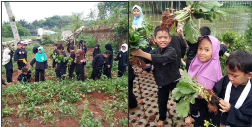
Figure 10. The students are harvesting vegetables

The third aspect of eco-literacy is hands/activity. It is shown by planning/manufacturing/using tools for the benefit of the community, ecological knowledge-based actions, as well as the effectiveness of energy use in everyday life. In general, students have planned tools for the benefit of society. This is supported by the results of interviews with the teachers. They stated, "To plan the manufacture of useful tools that have been done several times both in the upper class and in the lower class. For example, students once made composters to help manage waste in a village they visited, while in the lower grades the tools they made were simple, such as making windmills" (Figure 10 & 11).