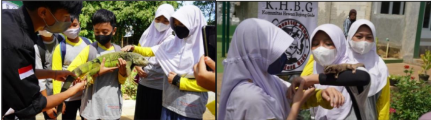
Figure 9. Students are chatting with wild animals

daily life, no children isolate or rule out ABK and they do not discriminate against those with ABK. Then, for students who love plants, those who started at the playgroup level have become friends with plants. So, no one hurts the plants or pulls the plants, except for the pomegranate plants. Thank God, the children already understand that plants must be cared for and loved, especially among their friends. Thank God, the children have become empathetic. They have had a sense of affection. From the playgroup to elementary school, they look more mature" (Figure 9).